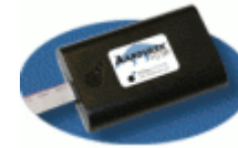
Aardvark I2C/SPI Host Adapter