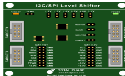
Figure 1: Level Shifter Board